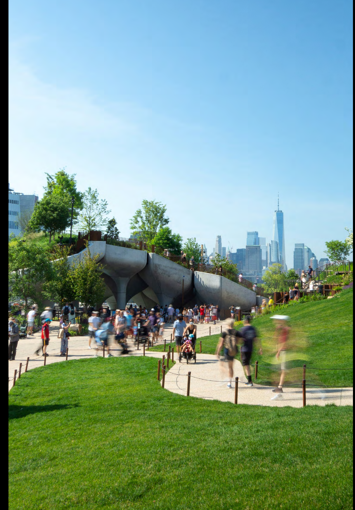
LITTLE ISLAND 1.5M+