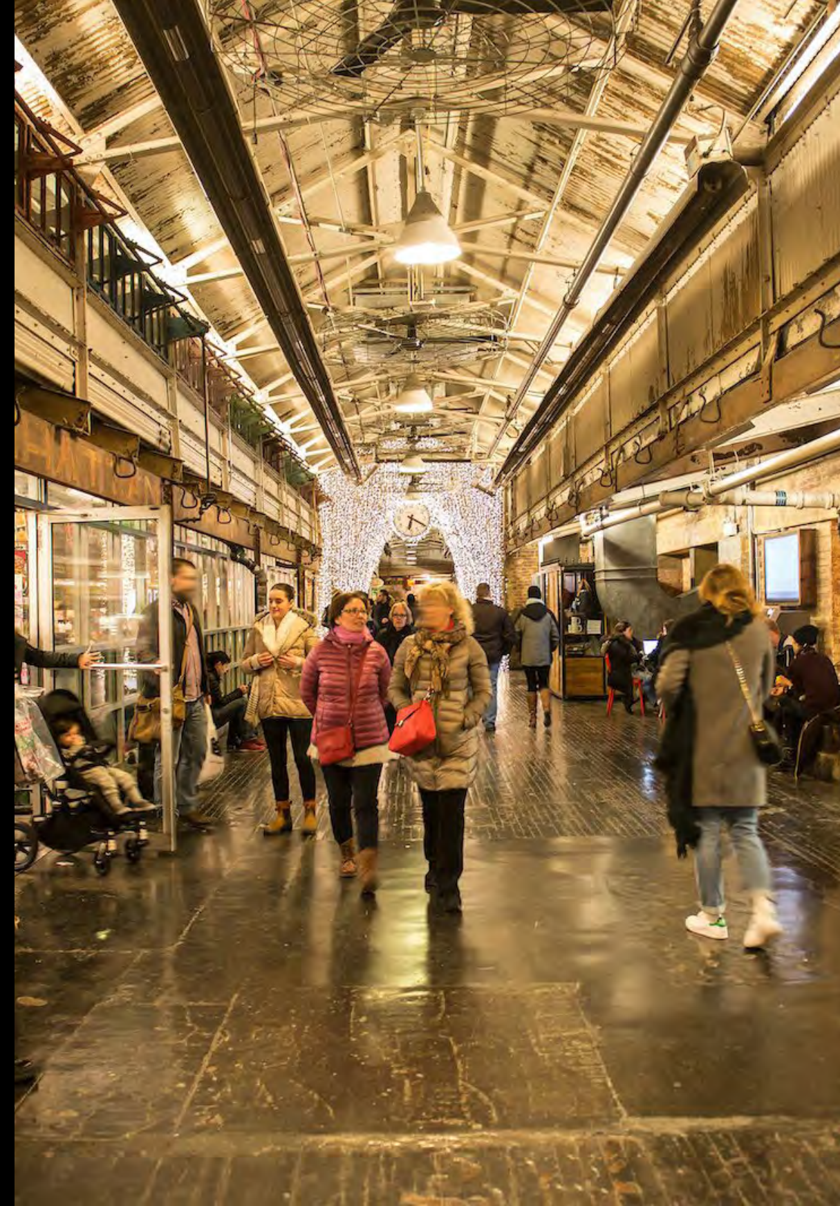
CHELSEA MARKET 6M+